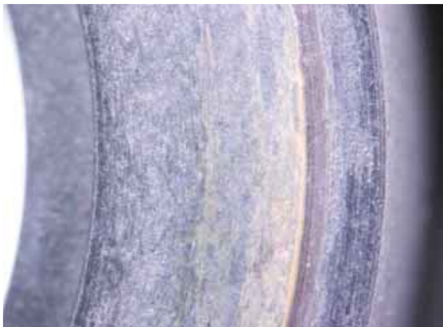
This mechanical seal has been scored due to corrosion byproducts and/or metal contamination of the fluid.

Dow Chemical Co., Midland, Mich., distributes a technical bulletin entitled, "Acidic Thermal Degradation of Ethylene